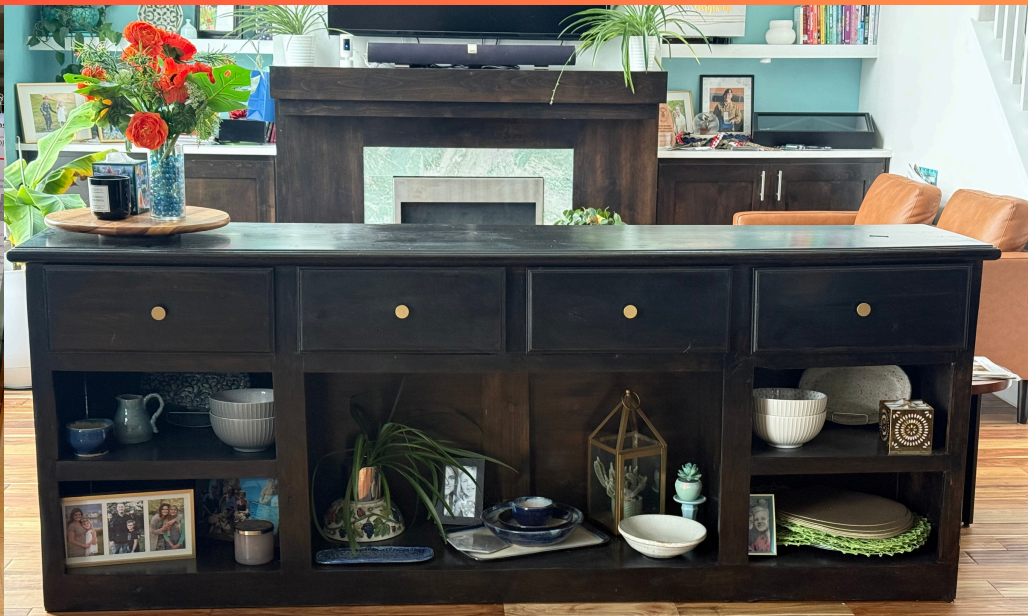
CUSTOM BUILT & DESIGNED 7' CONSOLE